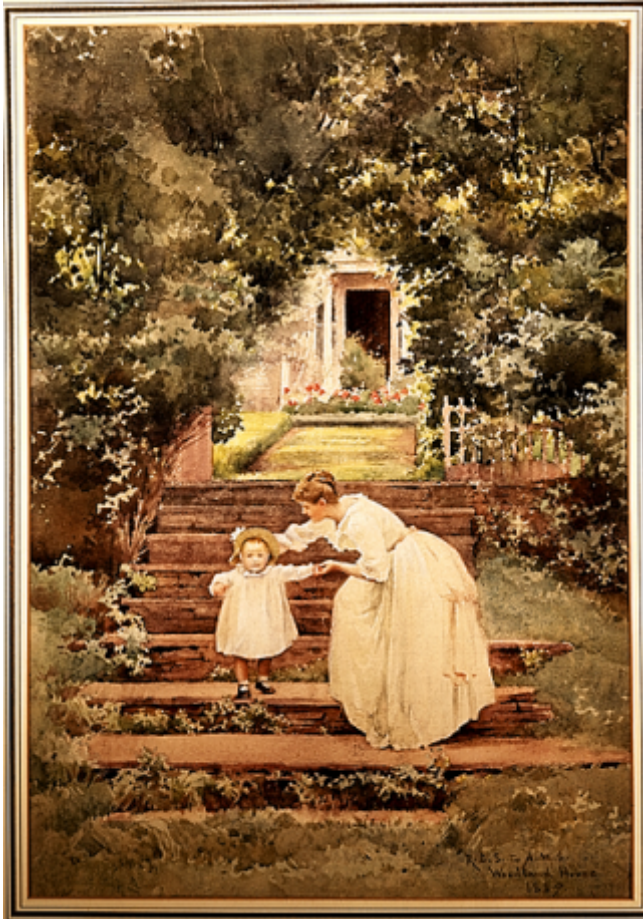
Woodland house. Rosina Emmet Sherwood, 1881 or 1882