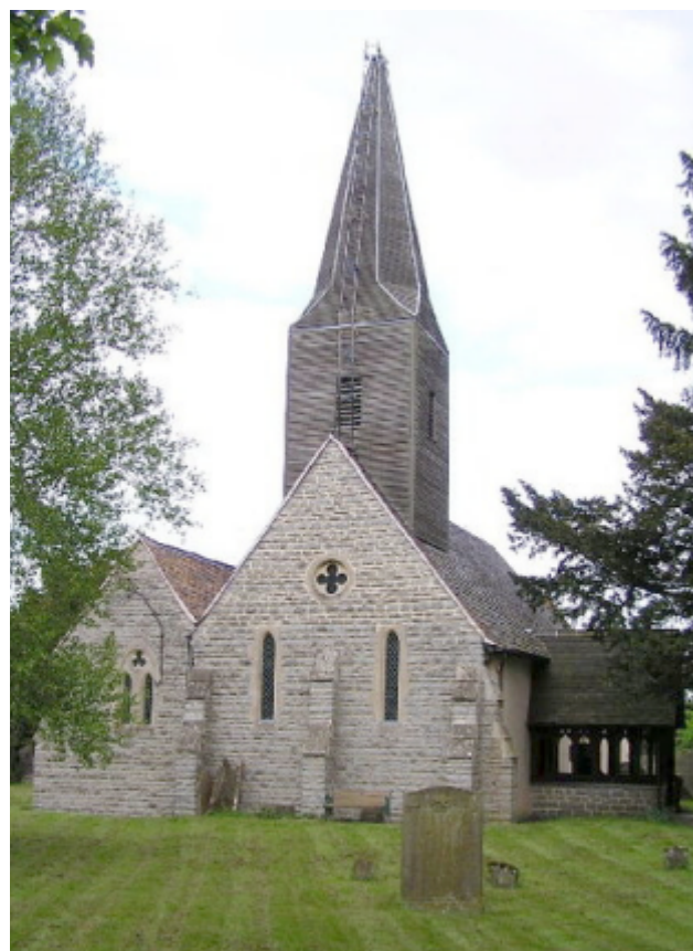
The church of ST. JOHN BAPTIST

Founded in Norman times, the historic Church of St. John the Baptist in White Ladies Aston, which has been closed for many months whilst extensive repairs, alterations and extensions were carried out, has been re-opened for regular services. A complete new North Aisle and Vestry have been built, the Early English stonework and timbers have been completely overhauled. New pews have been installed and the seating accommodation increased from 73 to 155. An