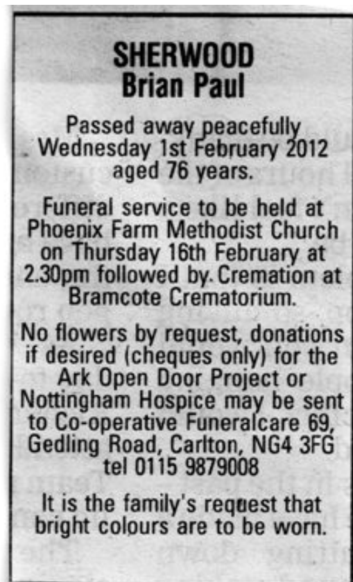
An example from the Nottingham Post 8th February 2012

The Names in Stone site http://www.namesinstone.com/ has been named among top 100 sites by Family Tree Magazine.