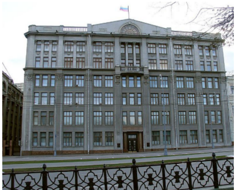
Titov Building, at 4, Staraya Square