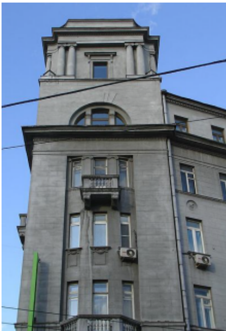
1, Solyanka Street

Vladimir best known work, the Titov Building, at 4, Staraya Square. In 1920s the Titov Building housed the Central Committee of the Communist Party of the Soviet Union headquarters and became the symbol of party apparatus. It is currently occupied by the Presidential Administration of Russia. The Titov building, built in 1915 remained the last recorded work by Vladimir; he lived the remaining 15 years of his life in Moscow in retirement and died there on 18 th June 1930.