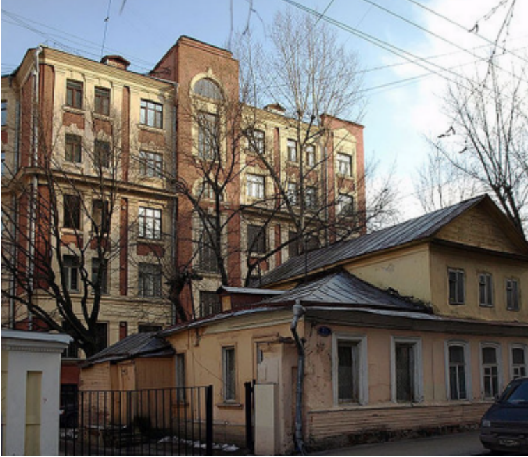
7-7 Malaya Polyanka Street

are listed on the protected buildings register: 12-14 Novokuznetskaya Street, 7-7 Malaya Polyanka Street (Ivan Shmelyov home), and a large neoclassical block at 1, Solyanka Street.