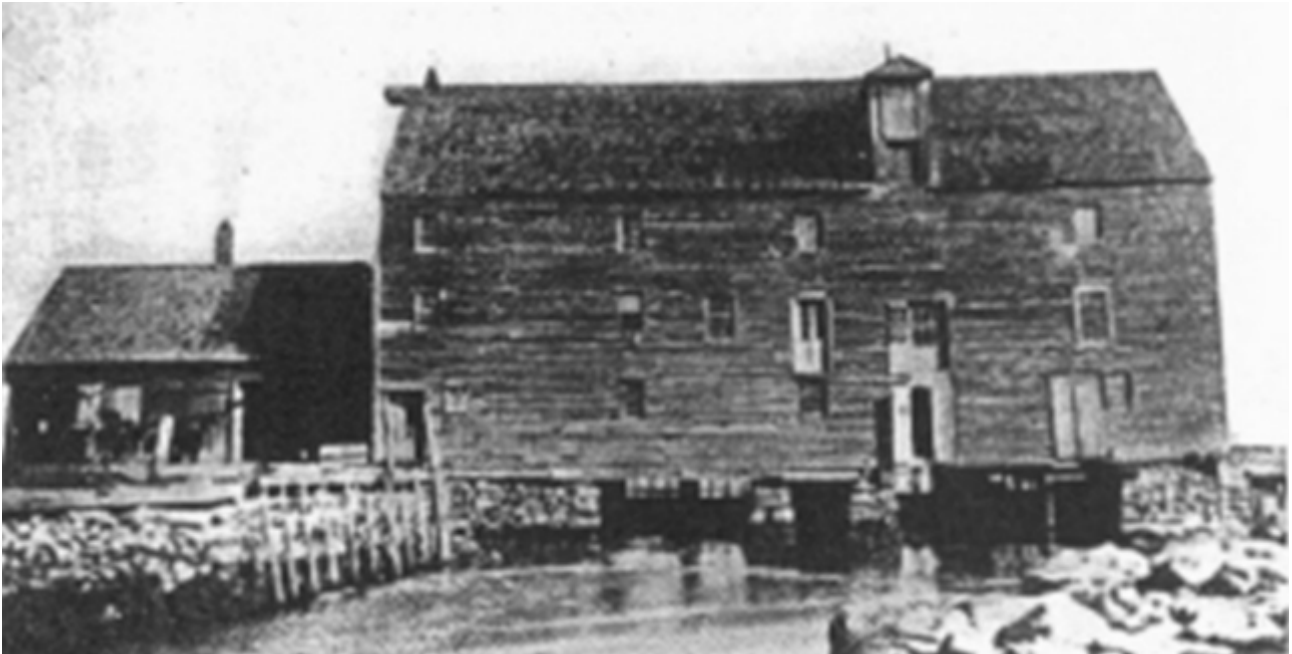
The Compo Tide Mill