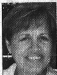
The Arizona Republic [Phoenix, Arizona, USA] on Weds 6 Jul 2011, pg B6