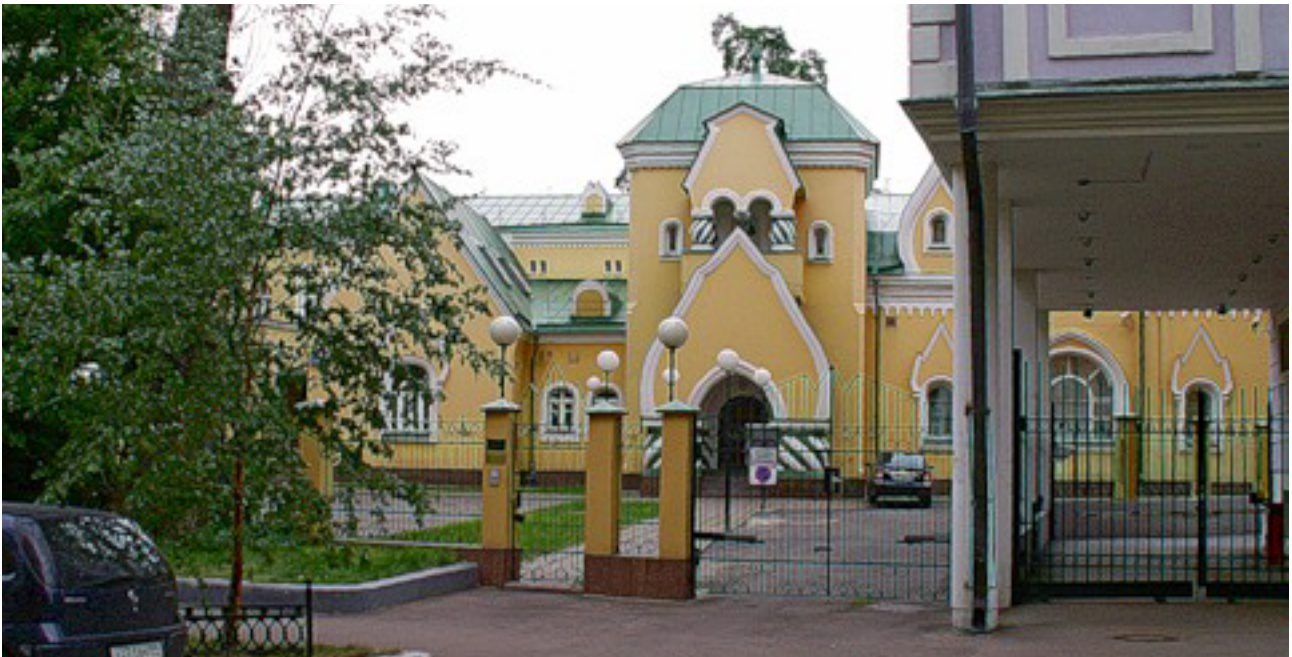
Terem of Sherwoods